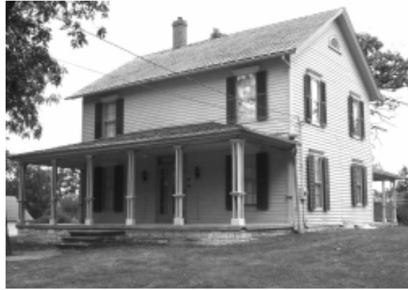
The family home of Orland Park's first mayor, located at 9830 West 144th Place, has been added to the National Register of Historic Places.

He also served as a State Senator and, during this time continued his involvement as Supervisor of many of Orland Township activities.