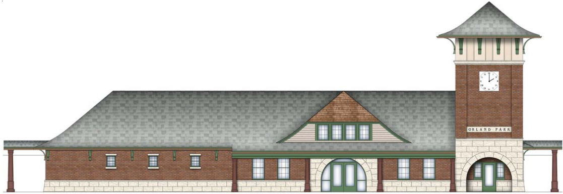
Phase I of the Main Street Triangle, a planned downtown development at 143 rd Street along Southwest Highway, includes a new Metra Commuter Station with parking.