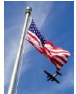
Barbie III Flyover sponsored by Horton Insurance