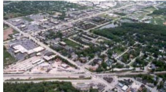
The revision of the village's Old Orland Historic District Codes and Guidelines will help to protect important buildings that are part of the village's history.

The village issued a Request for Proposals (RFP) for the Triangle Development in August, 2005, and received a positive response from the development community.