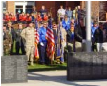
Orland Park Veterans

VILLAGE OF ORLAND PARK VETERANS' MEMORIAL DEDICATED NOVEMBER 11, 1995 Ara Pace - Place of Peace "...a memorial pavilion, a cathedral, encompassing the circle of endless memory of those who have died for our country supported by the conflict and sacrifice in the tension of the supporting elements of the base." "This environmental sculpture represents a meeting point; a meditation point; a spiritual point; a gathering point; a unique elegant quiet place to meet; a child friendly design; a place where older can mingle with the young; an ennobling addition to Orland Park..." From the 1995 Dedication Program