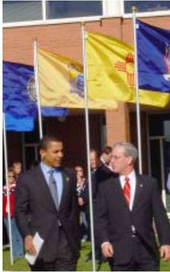
United States Senator Barack Obama and Mayor Dan McLaughlin